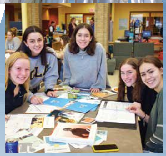
Students at Ask an Alum, 2019